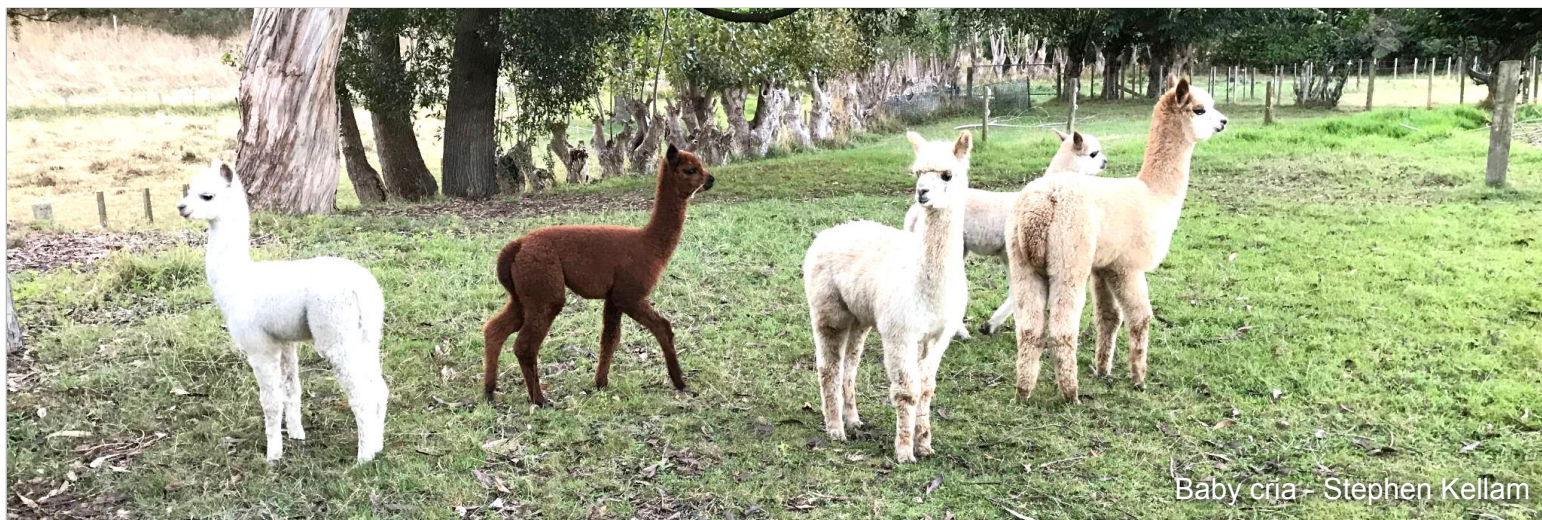
Baby cria

Your Monthly Central Region Newsletter From The Alpaca Association New Zealand